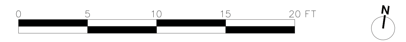
1 FIRST FLOOR PLAN A121 Scale: 1/4" = 1'-0"